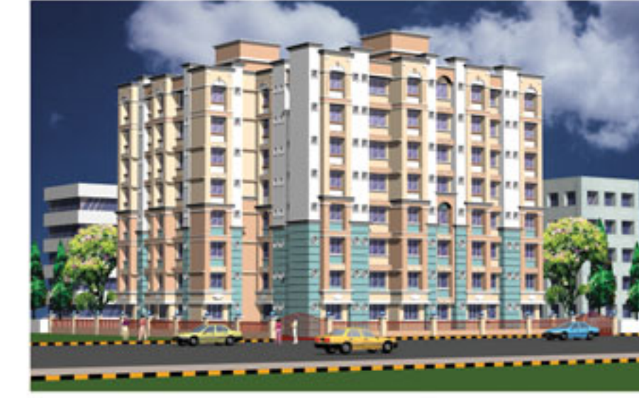
Matoshree Chhaya, Bhandup, Mumbai