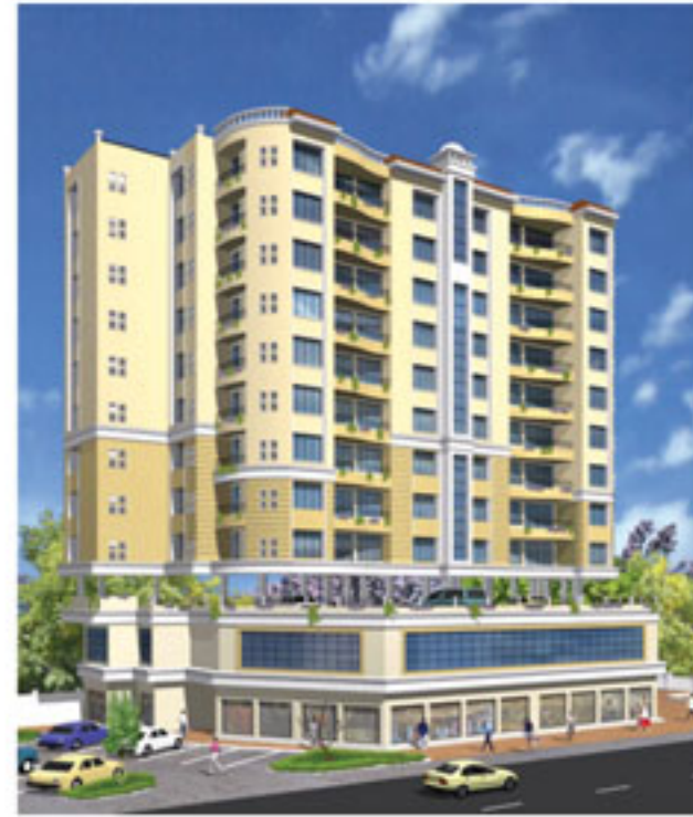
BPS PHHD BhId2, Mulund, Mumbai