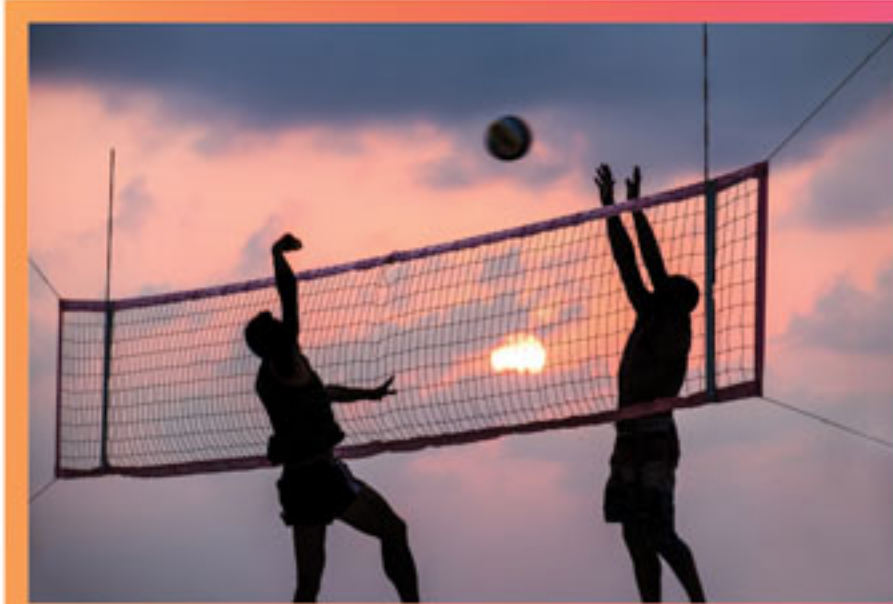
Physical development & Sports