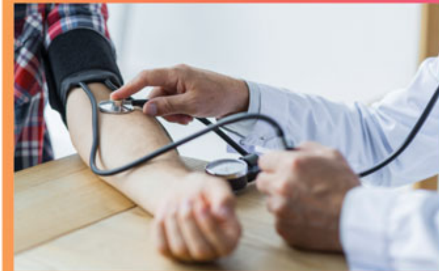
Medical Check up camps for Labour