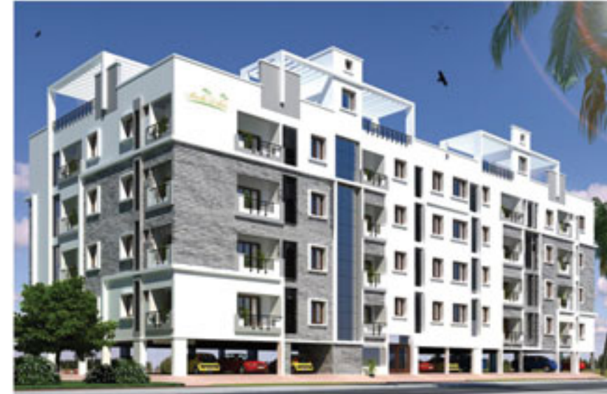
Aristo Palms, Bangaluru