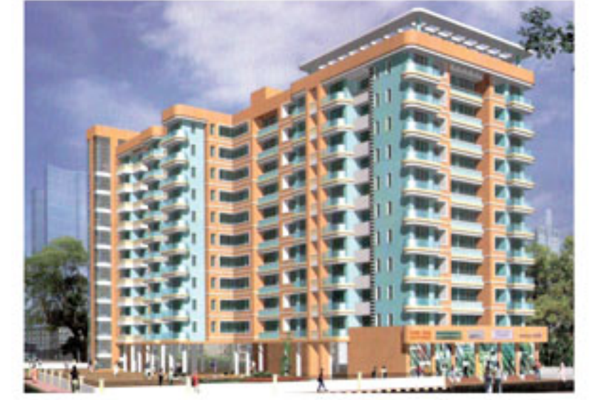
Sagar Avenue II, Santacruz (E) Mumbai